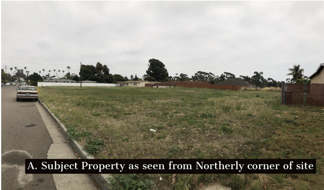
A. Subject Property as seen from Northerly corner of site