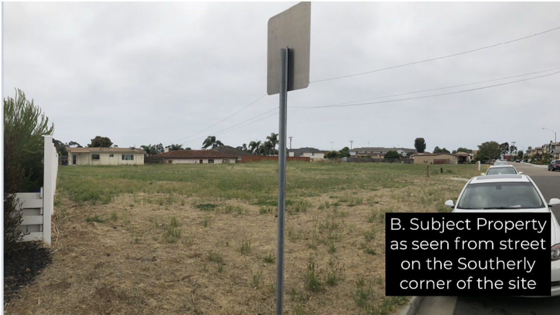
B. Subject Property as seen from street on the Southerly corner of the site